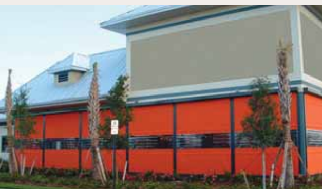
Increase Revenue in Bad Weather