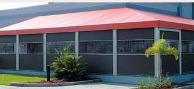
Keep the heat in