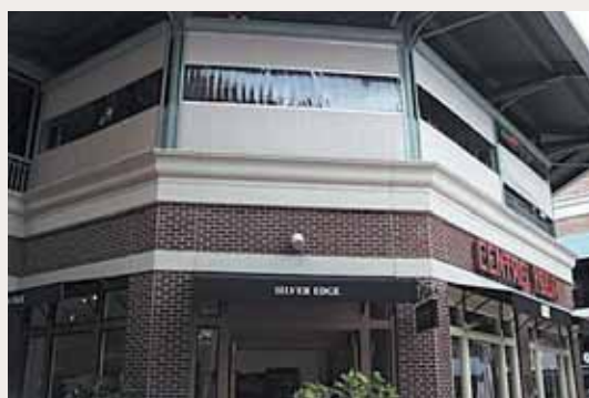
Keep rain and wind out