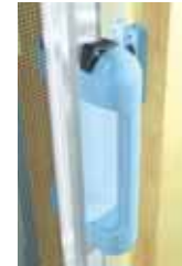
Patent pending handle exclusive to authorized Mirage Dealers.