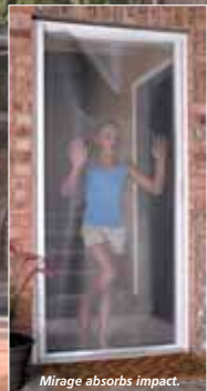
Mirage absorbs impact.