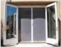
French Double Out-Swing

For use on windows, the maximum housing length available is 75" with a maximum 'pull' length of 55". Window screens can be mounted horizontally or vertically.